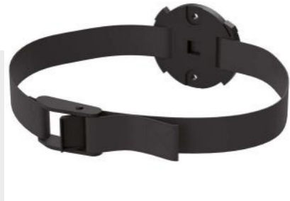
85990210 Nylon Disk with adjustable velcro strap for extinguishers Ø 190/205 mm