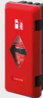
82020 / 82030