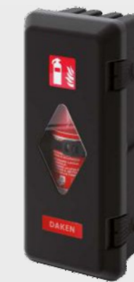
82000 / 82010